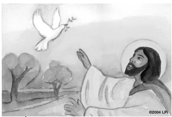
6<sup>th</sup> Sunday of Easter ~ 1<sup>st</sup> May 2016

"Peace I leave with you; my peace I give to you. Not as the world gives do I give it to you. Do not let your hearts be troubled or afraid. You heard me tell you, 'I am going away and I will come back to you.' If you loved me, you would rejoice that I am going to the Father; for the Father is greater than I." — 10^{-14:27\cdot28}